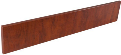
False Front, edging on all edges