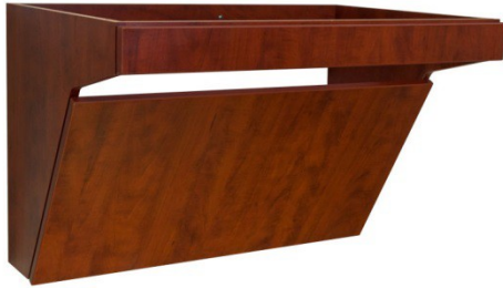
VANITY with removable panel